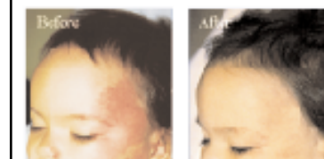
Port wine stains